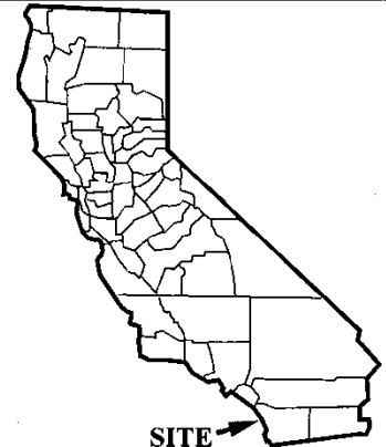
Exhibit A PRC 8716.1 LAS BRISAS HOA APN 298-010-54 GENERAL LEASE- PROTECTIVE STRUCTURE SOLANA BEACH SAN DIEGO COUNTY

This Exhibit is solely for purposes of generally defining the lease premises, is based on unverified information provided by the Lessee or other parties and is not intended to be, nor shall it be construed as, a waiver or limitation of any State interest in the subject or any other property.