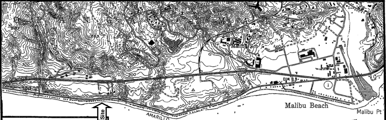
Exhibit A W24665 24832 Malibu Road