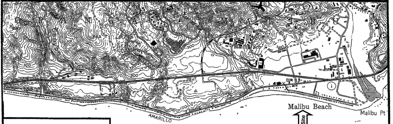
Exhibit A W24665 23634 Malibu Colony Road