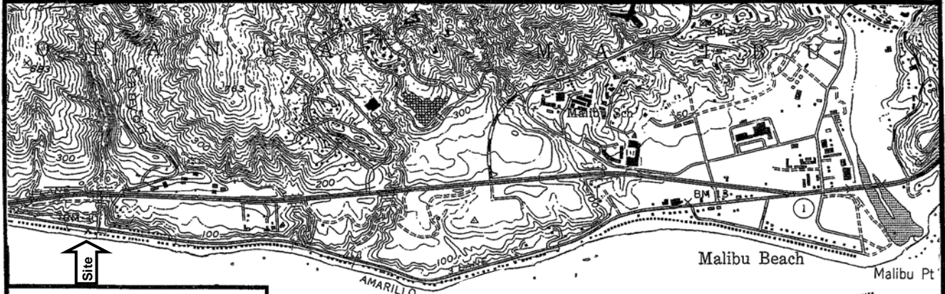
Exhibit A W24665 25250 Malibu Road