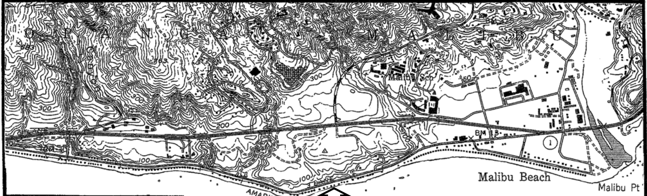
Exhibit A W24665 24300 Malibu Road