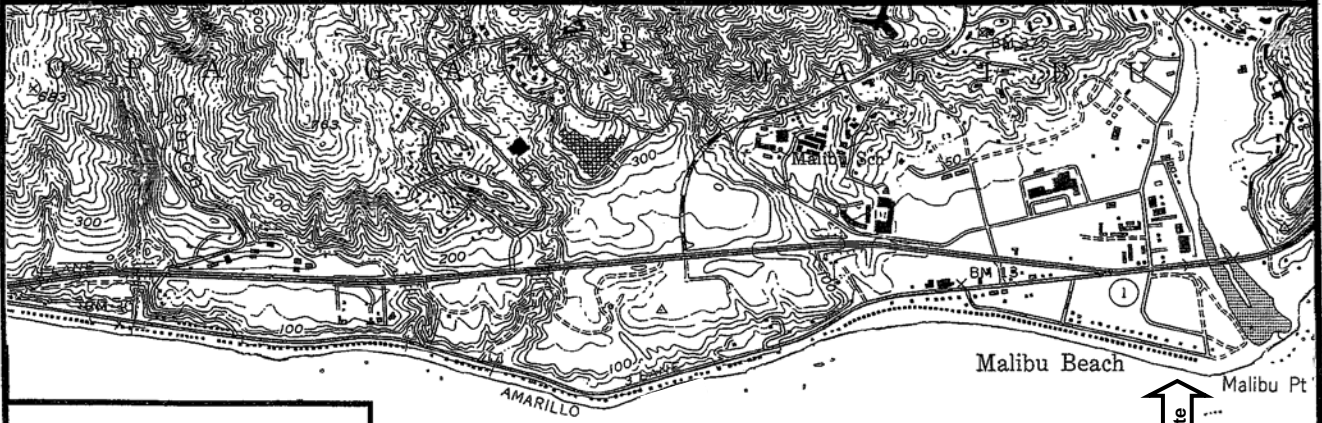
Exhibit A W24665 23338 Malibu Colony Road