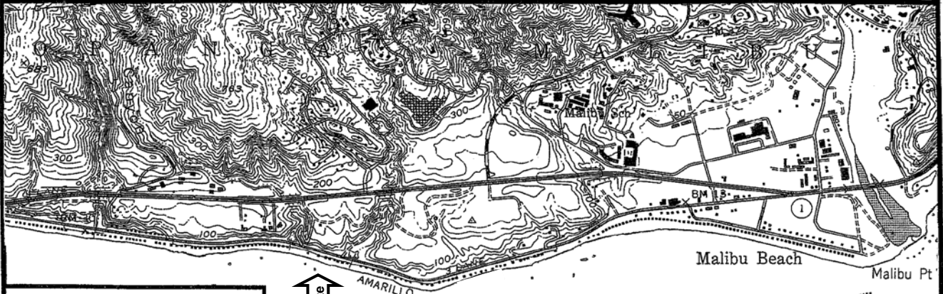
Exhibit A W24665 24616 Malibu Road