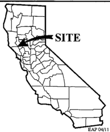
Exhibit A PRC 6882.2 CCPA No. 1 ACCEPT QUIT CLAIM OF RECIPROCAL ROAD USE EASEMENT LAKE, SONOMA, & MENDOCINO COUNTIES

This Exhibit is solely for purposes of generally defining the lease premises, is based on unverified information provided by the Lessee or other parties and is not intended to be, nor shall it be construed as, a waiver or limitation of any State interest in the subject or any other property.