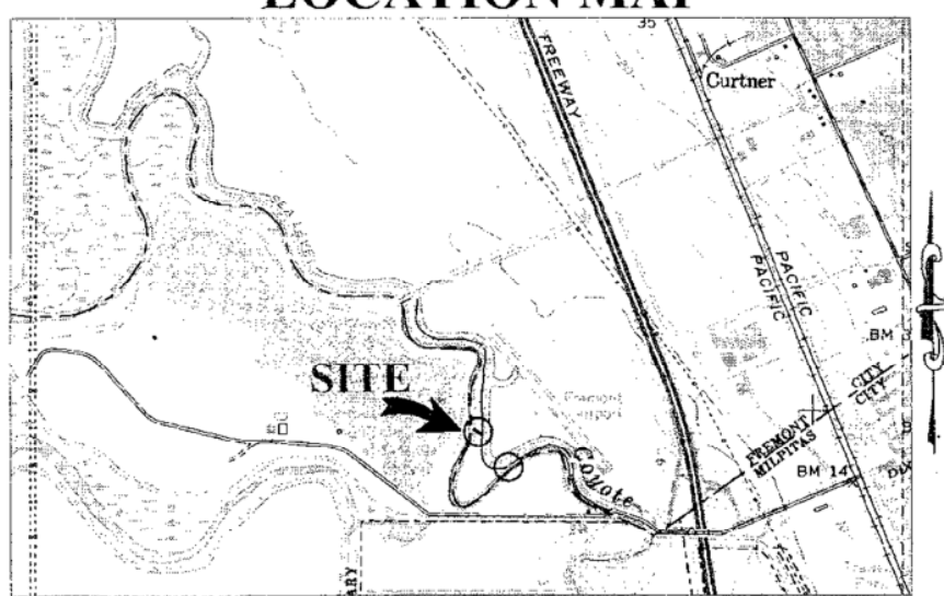
This Exhibit is solely for purposes of generally defining the lease premises, is based on unverified information provided by Lessee or other parties, and is not intended to be, nor shall it be construed as a waiver or limitation of any state interest in the subject or any other property.