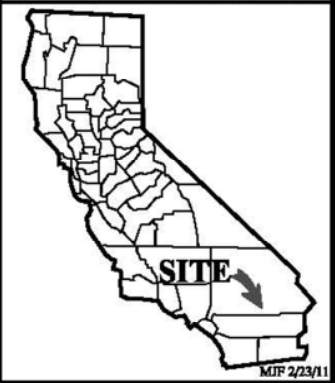
Exhibit B W 40951 BAGDAD CHASE, INC. APN 0551-171-12 SOLID MINERAL PROSPECTING PERMIT: SURFACE SAMPLING SAN BERNARDINO COUNTY

This Exhibit is solely for purposes of generally defining the lease premises, is based on unverified information provided by the Lessee or other parties and is not intended to be, nor shall it be construed as, a waiver or limitation of any State interest in the subject or any other property.