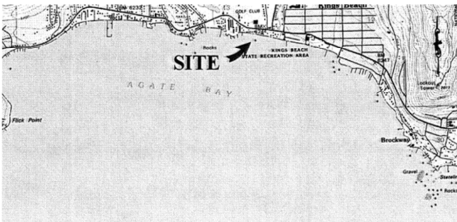
MAP SOURCE: USGS QUAD

This Exhibit is solely for purposes of generally defining the lease premises, is based on unverified information provided by the Lessee or other parties and is not intended to be, nor shall it be construed as, a waiver or limitation of any State interest in the subject or any other property.