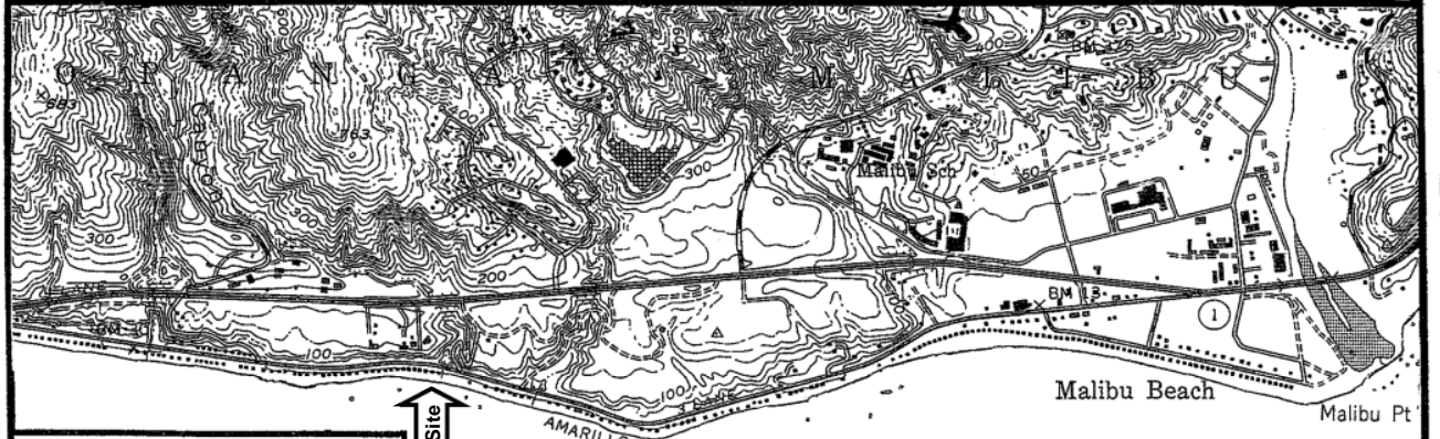
Exhibit A W24665 24762 Malibu Road