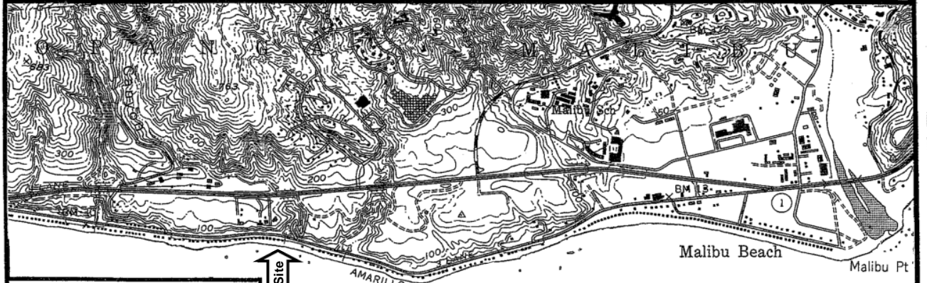
Exhibit A W24665 24758 Malibu Road