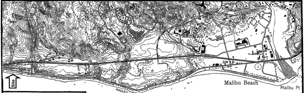
Exhibit A W24665 25406 Malibu Road