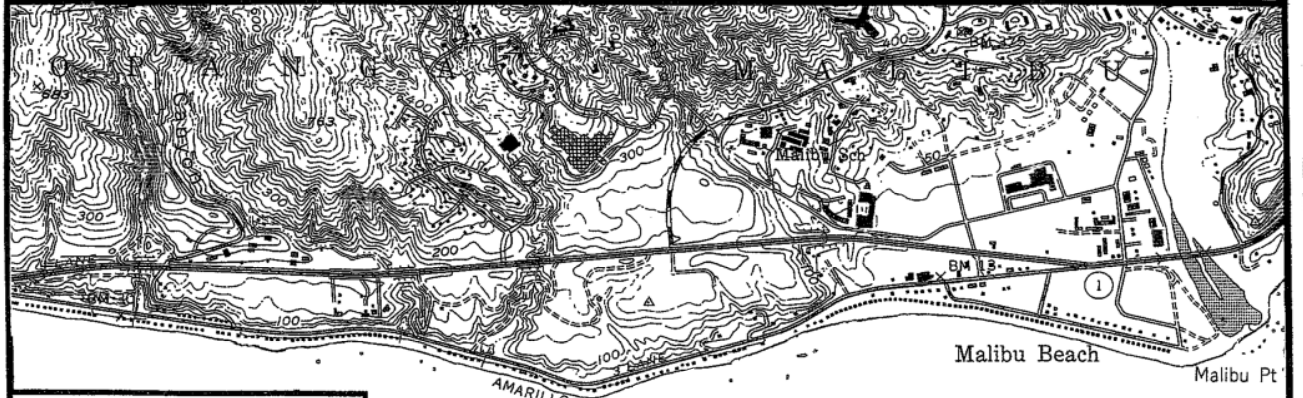
Exhibit A W24665 24434 Malibu Road