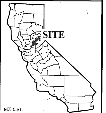
Exhibit A MUSTANG AIRPORT CONVERSION AND EXPANSION/COSUMNES RIVER PRESERVE SACRAMENTO COUNTY

This Exhibit is solely for purposes of generally defining the premises, is based on unverified information provided by the Lessee or other parties and is not intended to be, nor shall it be construed as, a waiver or limitation of any State interest in the subject or any other property.