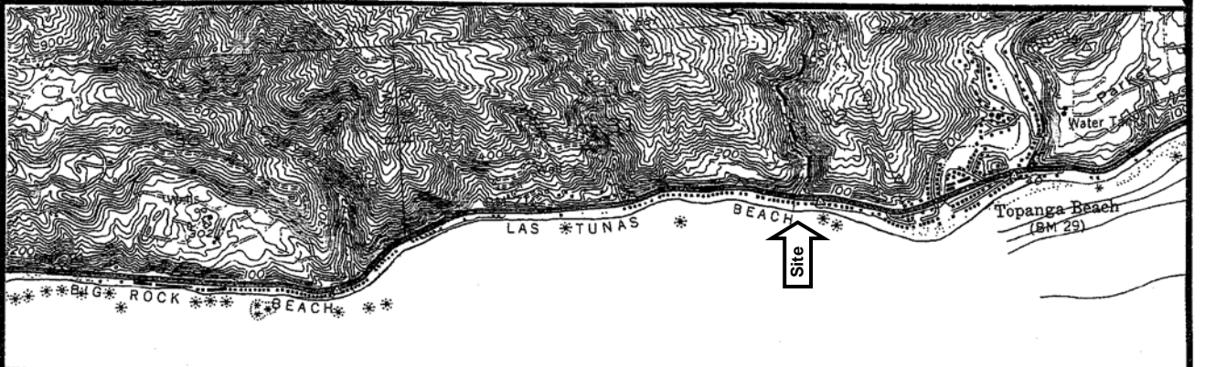
Exhibit A W24665 19010 Pacific Coast Highway