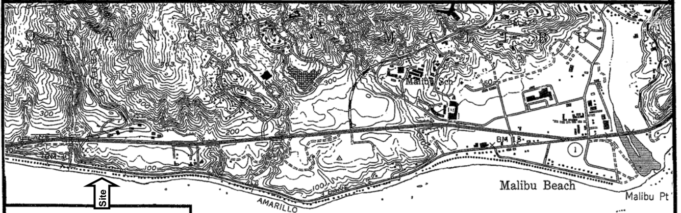
Exhibit A W24665 25410 Malibu Road