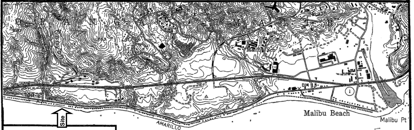
Exhibit A W24665 25200 Malibu Road