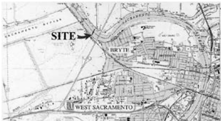
Exhibit A PRC 8664.1 PACIFIC GAS & ELECTRIC GENERAL LEASE RIGHT OF WAY USE SACRAMENTO AND YOLO COUNTY