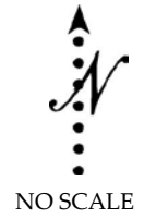
Exhibit A AT&T CORP. GENERAL LEASES RIGHT OF WAY USE Fiber Optic Cables

This exhibit is solely for purposes of generally defining the lease premises, is based on unverified information provided by the Lessee or other parties, and is not intended to be, nor shall it be construed as a waiver or limitation of any State interest in the subject or any other property.