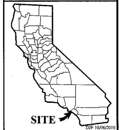
Exhibit A PRC 3288.1 HUNTINGTON MARINA ASSOCIATION APN 178-581-02, 178-581-003, 178-581-004, 178-581-005 GENERAL LEASE - RECREATIONAL USE ORANGE COUNTY

This Exhibit is solely for purposes of generally defining the lease premises, is based on unverified information provided by the Lessee or other parties and is not intended to be, nor shall it be construed as, a waiver or limitation of any State interest in the subject or any other property.