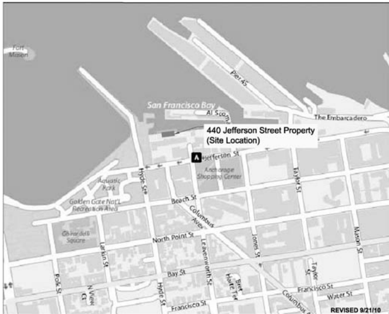
Exhibit A W 26434 EXXON MOBIL OIL CORP. COUNTY OF SAN FRANCISCO