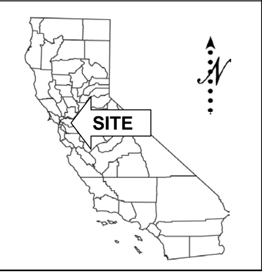
Exhibit A W 26440 STOCKTON SAILING CLUB DREDGING SAN JOAQUIN COUNTY

This exhibit is solely for purposes of generally defining the lease premises, is based on unverified information provided by the Lessee or other parties, and is not intended to be, nor shall it be construed as a waiver or limitation of any State interest in the subject or any other property.