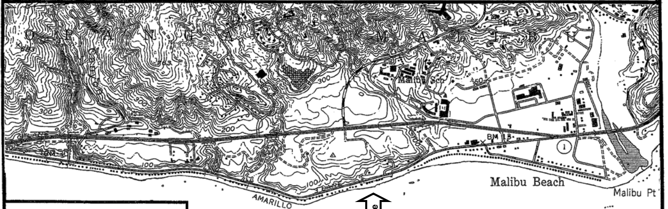
Exhibit A W24665 24212 Malibu Road