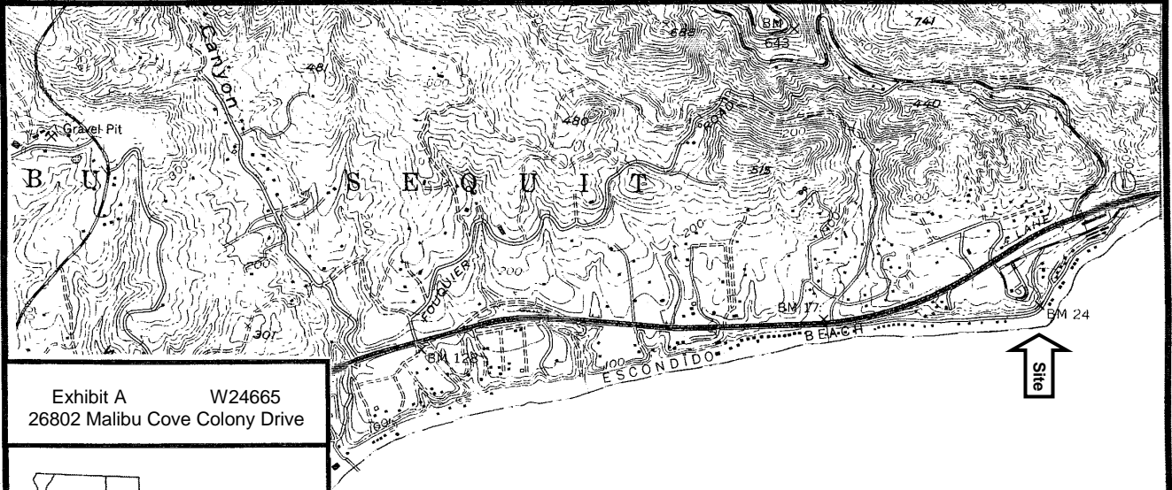
Exhibit A W24665 26802 Malibu Cove Colony Drive