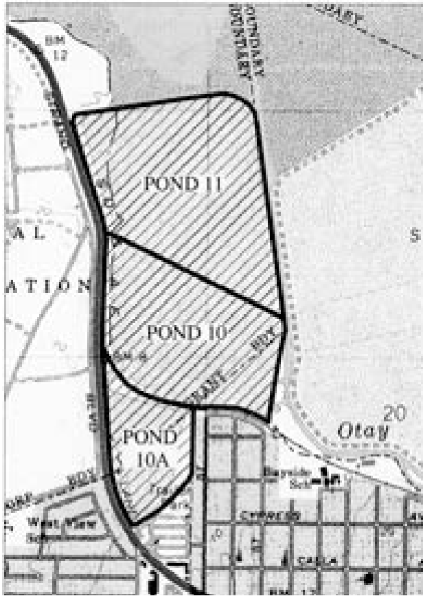
Western Salt Ponds