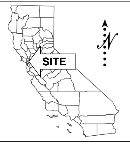
Exhibit A W 26406 PELICAN HARBOUR MARIN COUNTY

This exhibit is solely for purposes of generally defining the lease premises, is based on unverified information provided by the Lessee or other parties, and is not intended to be, nor shall it be construed as a waiver or limitation of any State interest in the subject or any other property.