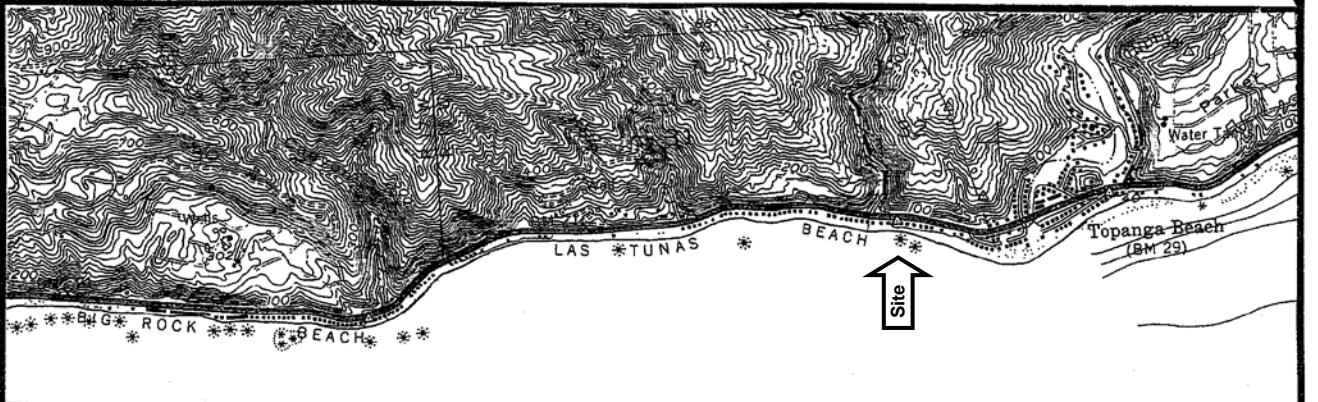
Exhibit A W24665 18928 Pacific Coast Highway