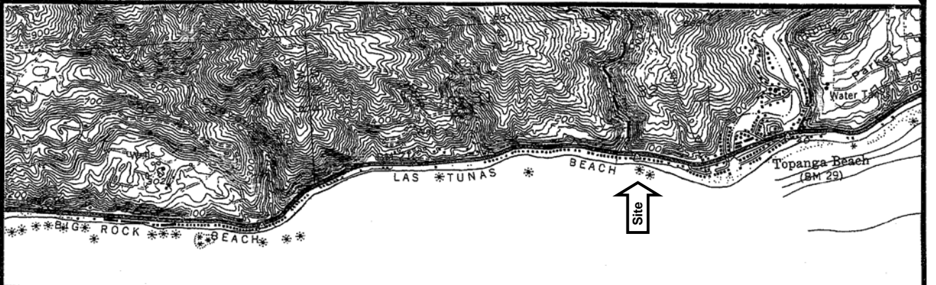
Exhibit A W24665 18922 Pacific Coast Highway