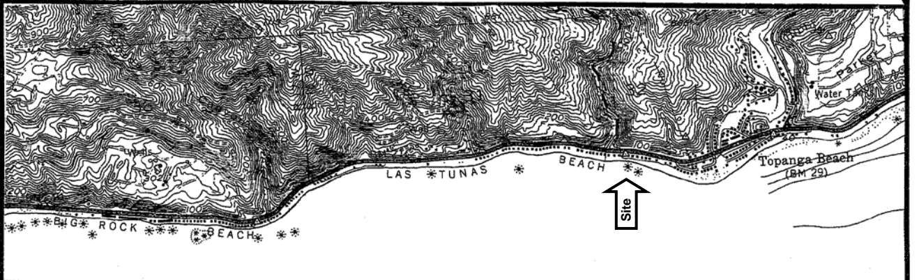
Exhibit A W24665 18926 Pacific Coast Highway