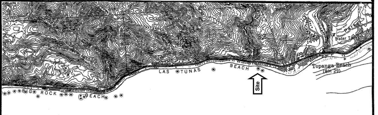
Exhibit A W24665 18918 Pacific Coast Highway