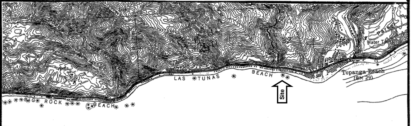
Exhibit A W24665 18930 Pacific Coast Highway