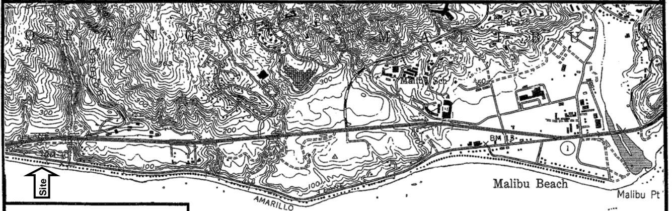
Exhibit A W24665 25322 Malibu Road