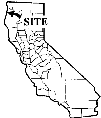
Exhibit A PRC 7797.1 MERCER-FRASER APN 106-041-015, 016, 200-352-02 GENERAL LEASE HUMBOLDT COUNTY

This Exhibit is solely for purposes of generally defining the lease premises, is based on unverified information provided by the Lessee or other parties and is not intended to be, nor shall it be construed as, a waiver or limitation of any State interest in the subject or any other property.