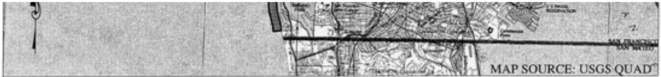
GOLDEN GATE NATIONAL RECREATION AREA