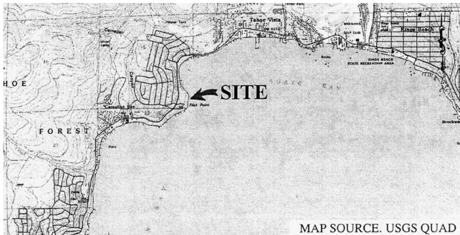
Exhibit A PRC 4330.1 CASSIN APN 116-220-057 GENERAL LEASE RECREATIONAL USE PLACER COUNTY