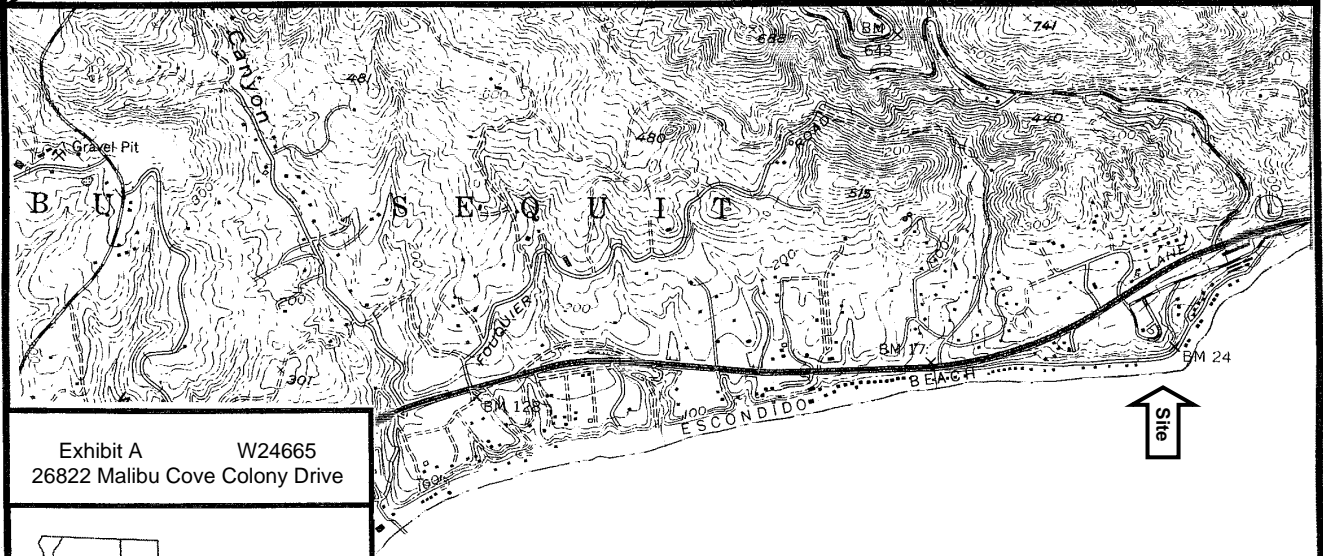
Exhibit A W24665 26822 Malibu Cove Colony Drive