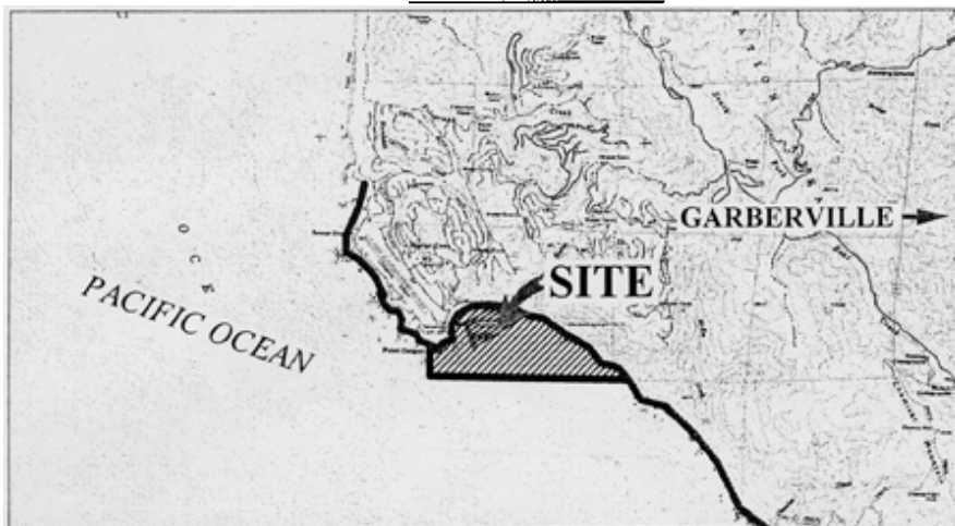
Exhibit B PRC 1956.9

HUMBOLDT BAY HARBOR RECREATION AND CONSERVATION DISTRICT GENERAL LEASE PUBLIC AGENCY USE HUMBOLDT COUNTY