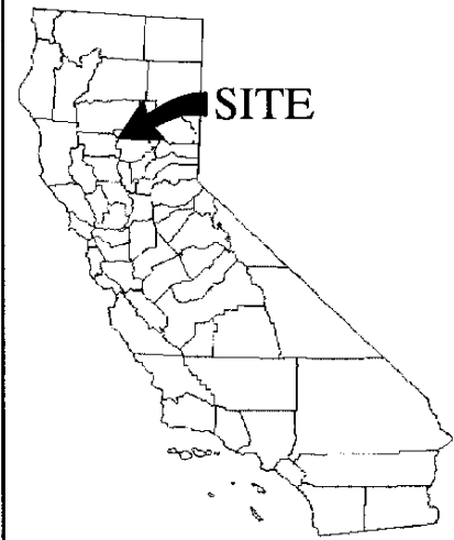
EXHIBIT A WP 4911.9 City of Chico General Lease - Public Agency Use Sacramento River Butte County

This Exhibit is solely for the purposes of generally defining the lease premises, is based on unverified information provided by Lessee or other parties, and is not intended to be, nor shall it be construed as a waiver or limitation of any state interest in the subject or any other property.