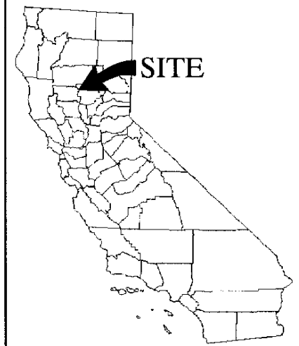
EXHIBIT A WP 4911.9 City of Chico General Lease - Public Agency Use Sacramento River Butte County

This Exhibit is solely for the purposes of generally defining the lease premises, is based on unverified information provided by Lessee or other parties, and is not intended to be, nor shall it be construed as a waiver or limitation of any state interest in the subject or any other property.