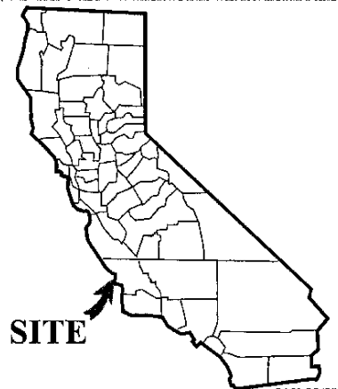
Exhibit A PRC 8144, W 26237 AT&T CORP. APN 074-021-040 GENERAL LEASE RIGHT-OF-WAY USE SAN LUIS OBISPO CO.

This Exhibit is solely for purposes of generally defining the lease premises, is based on unverified information provided by the Lessee or other parties and is not intended to be, nor shall it be construed as, a waiver or limitation of any State interest in the subject or any other property.