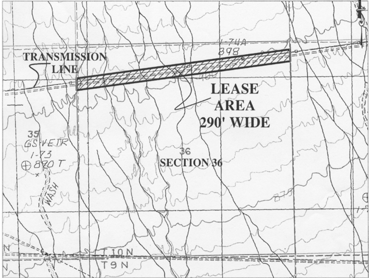
Sec 36, T10N. R15E, SBM 500 kv transmission line