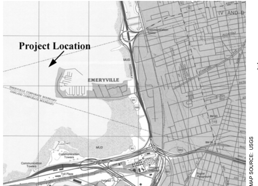
This Exhibit is solely for purposes of generally defining the lease premises, and is not intended to be, nor shall it be construed as, a waiver of limitation of any state interest in the subject or any other property.