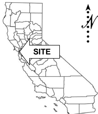
Exhibit A SAN RAFAEL ROCK QUARRY WHARF W 25180 MARIN COUNTY

This exhibit is solely for purposes of generally defining the lease premises, is based on unverified information provided by the Lessee or other parties, and is not intended to be, nor shall it be construed as a waiver or limitation of any State interest in the subject or any other property.