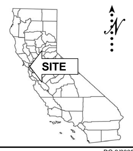
Exhibit A PRC 5733 Carquinez Strait CONTRA COSTA and SOLANO COUNTIES

This exhibit is solely for purposes of generally defining the lease premises, is based on unverified information provided by the Lessee or other parties, and is not intended to be, nor shall it be construed as a waiver or limitation of any State interest in the subject or any other property. Map Source: USGS