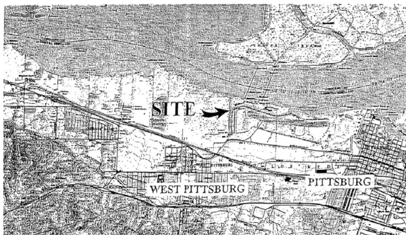
Exhibit A PRC 8546.1 RIO DELTA RESOURCES CONTRA COSTA COUNTY