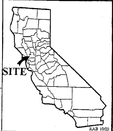
Exhibit A PRC 8486.1 SFPP, LP SOLANO and CONTRA COSTA COUNTIES

This Exhibit is solely for purposes of generally defining the lease premises, is based on unverified information provided by the Lessee or other parties and is not intended to be, nor shall it be construed as, a waiver or limitation of any State interest in the subject or any other property.