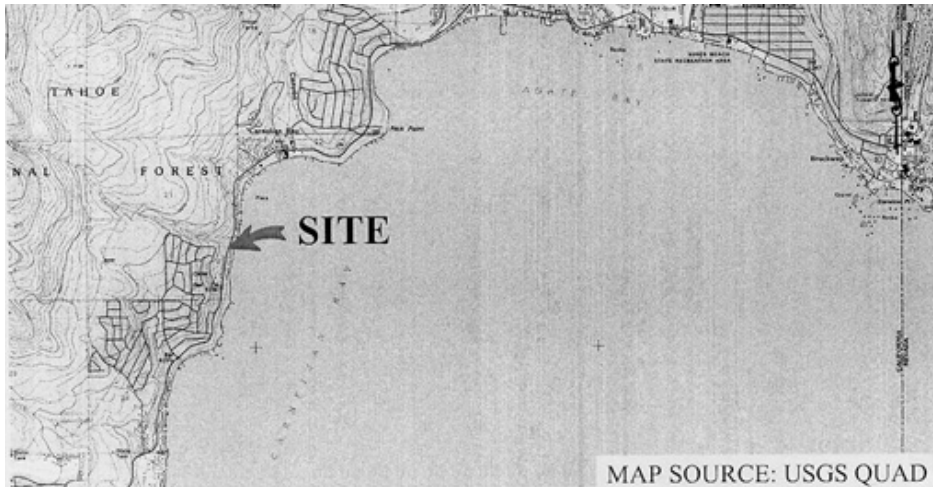
Exhibit A PRC 8448.1 GORDON PROPERTIES, LP APN 091-165-001 GENERAL LEASE RECREATIONAL USE PLACER COUNTY