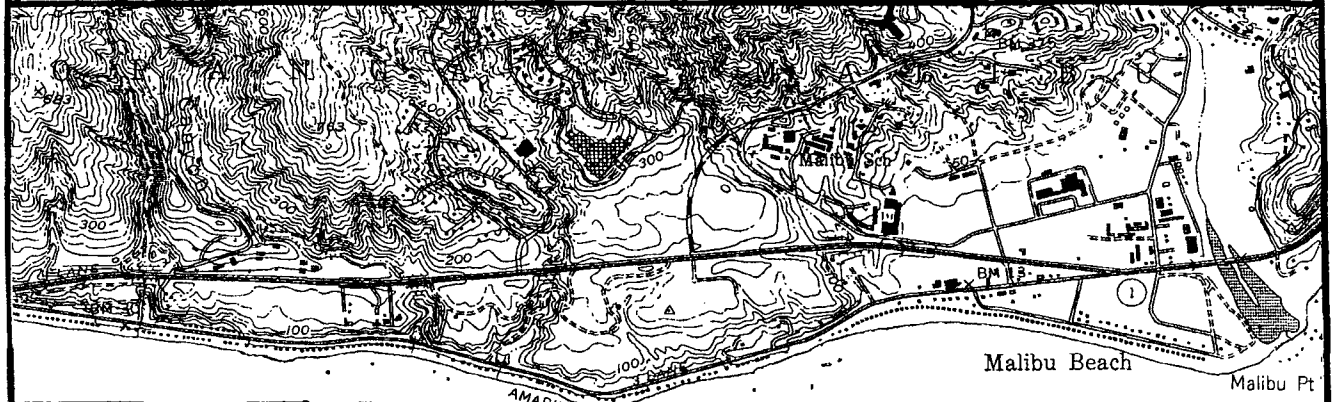
Exhibit A W24665 24538 Malibu Road